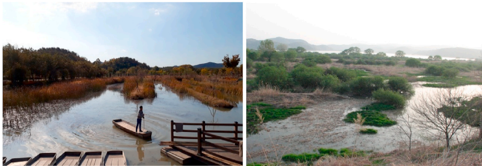
Fig. A. Upo Wetland.